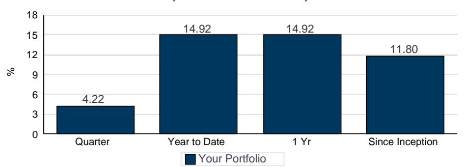
Time-Weighted Annualized Returns June 11, 2019 To December 31, 2020