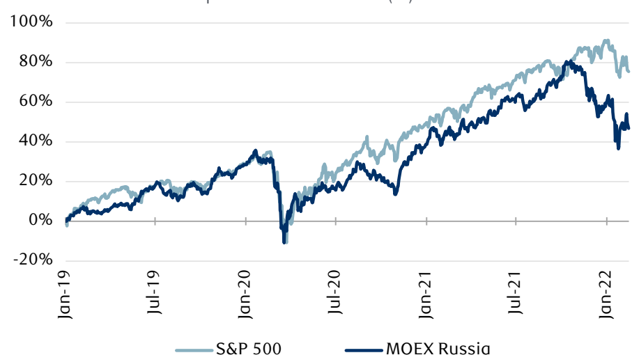
Source - RBC Wealth Management, Bloomberg; indexes measured in local currencies; data through 2/14/22

Thus far, there have been mixed signals about just exactly which types of sanctions the West would impose—with some officials threatening to cut off Russia from the international financial payments network known as SWIFT, and others saying that move would be too risky for the global financial system and Europe's economy. Recently, Western officials have delivered a more consistent message about potential harsh sanctions on Russia's largest banks, including restricting them from dollar-based transactions.