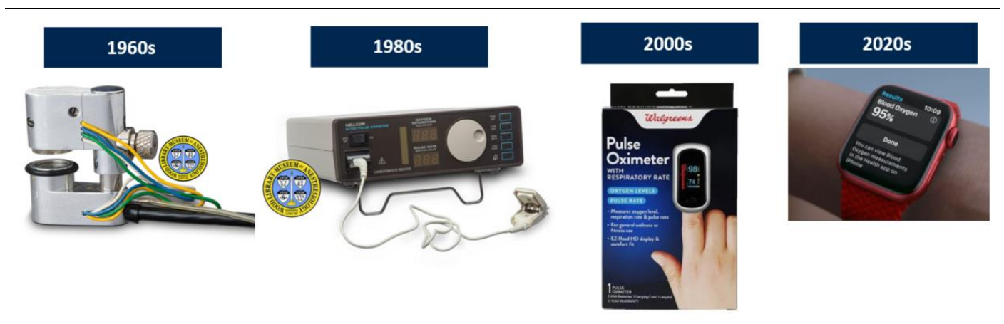
Exhibit 2: From product to feature, the evolution of the pulse oximeter