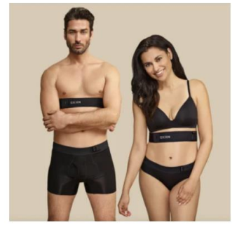
Exhibit 13: From performance to personal, these garments can track vitals and activity and be monitored remotely by, or sent to, a third party

For example, Skiin is a new company making performance wearables that include underwear, a sports bra, and a wearable band around the chest. Not only do the garments measure various vitals, they can also be monitored remotely. So rather than being worn by elite athletes, this can be a way to monitor the stats of perhaps an elderly loved one. We expect more innovations to tilt toward the elderly and elder care, as there are already more than 50mm Americans over the age of 65, and this demographic is expected to grow 50% in the next 20 years. According to the AARP, more than 90% of seniors want to stay in their homes as they age.