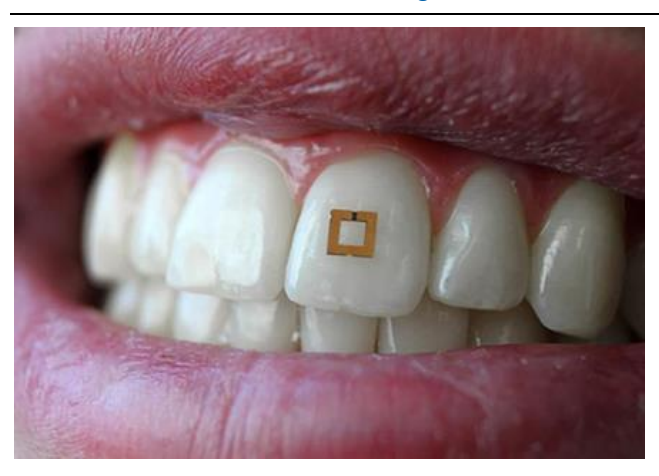
Exhibit 5: From chronic disease management to the curious and informed consumer

Source: Tufts University School of Engineering