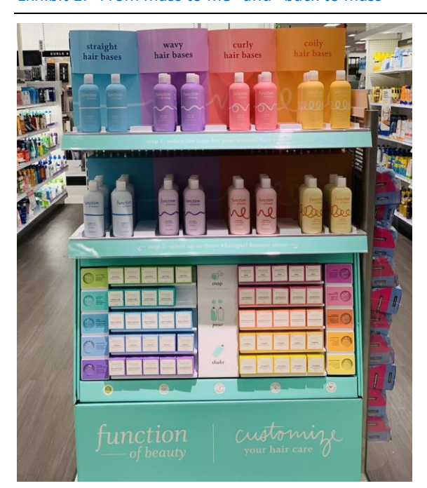
Exhibit 1: "From mass to me" and "back to mass"

In our original Imagine 2025 report, we highlighted the rise of "from mass to me" (technologies making it easier to customize at scale). Indeed, since then, we have seen the rise of "from mass to me"—and "back to mass"—for one of the examples we highlighted: Function of Beauty shampoo and conditioner. The shampoo and conditioner were custom-created for the user upon filling out an online survey about one's hair needs and preferences, e.g., texture, style, scent. Fast forward four years later, and the brand is now available in Target stores, with various base shampoos as well as a variety of "booster shots" to be added to the base by consumers based on their hair needs.