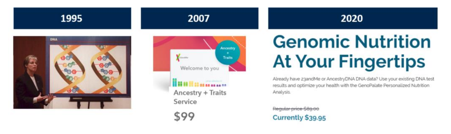
Exhibit 10: Our evolving relationship with DNA

We also note that when something moves from a lab or a hospital to the consumer space, its utility may not be immediately apparent or existent. Take, for example, DNA testing. The American public was still mostly unfamiliar with DNA testing in the mid-1990s when it first started garnering attention due to highly publicized/televised criminal trials. Fast forward 30 years and the popularity of at-home DNA testing has soared and become quite commonplace among everyday consumers. Why? What consumer problem does it solve for one to learn they are 5% Eastern European?