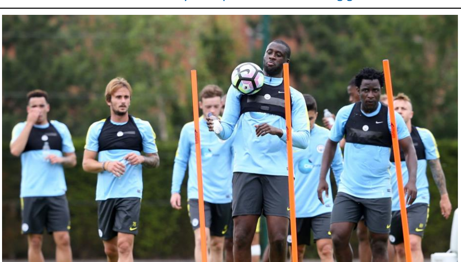
Exhibit 12: Several brands already offer performance-tracking garments for athletes