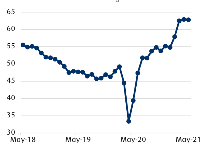
Source - RBC Wealth Management, Bloomberg; monthly data through May 2021

even further in June. Meanwhile, manufacturing activity is plateauing due to certain supply chain shortages, but the IHS Markit Eurozone Manufacturing PMI has remained above 62, a very healthy level, since March.