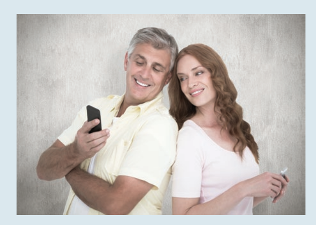
Note: To ensure that your own circumstances have been properly evaluated, it is important to consult with a professional tax and legal advisor to complete a cost/benefit analysis and determine the best options for your individual needs.

Dominic purchased a cottage in 1998 for $140,000. In 2003, he spent $50,000 on an addition. The cottage is currently valued at $420,000. The area where the cottage is located is becoming very popular and property values are anticipated to increase significantly in the coming years. If Dominic decides to gift the property now to his daughter, Angela, that would create a capital gain of $230,000, 50 percent of which would be taxable at his marginal tax rate (unless it is designated as his principal residence). If Dominic decides to instead bequeath the property in his Will and the cottage ultimately ends up being valued at $600,000 when he passes away, the capital gains would then be $410,000, 50 percent of which would be taxable to his estate. Although gifting it now may result in a pre-payment of some tax, it may offer significant savings in capital gains tax, if the upward trend in property value continues in the same pattern.