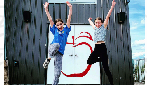
Marnie: Lake Country Food Bank