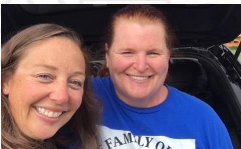
Pam: All Are Family Outreach