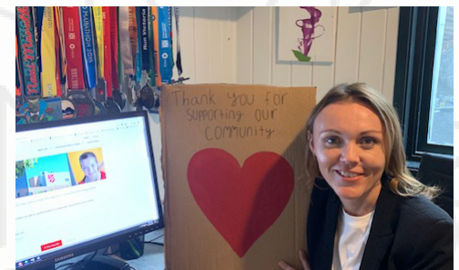
Rossi: Vernon Food Bank