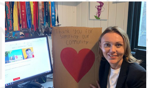
Rossi: Vernon Food Bank