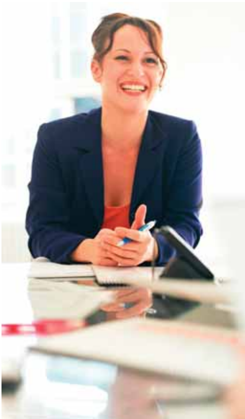
CHART YOUR COURSE TO FINANCIAL INDEPENDENCE WITH PROFESSIONAL ADVICE FROM YOUR RBC INVESTMENTS ADVISOR

With RBC Investments, you have access to comprehensive wealth management solutions designed around you. All the services you need are available through your personal advisor, including investment advice, financial planning, discretionary portfolio management, global banking and estate planning.