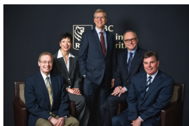
Tom Caldwell Wealth Management Group